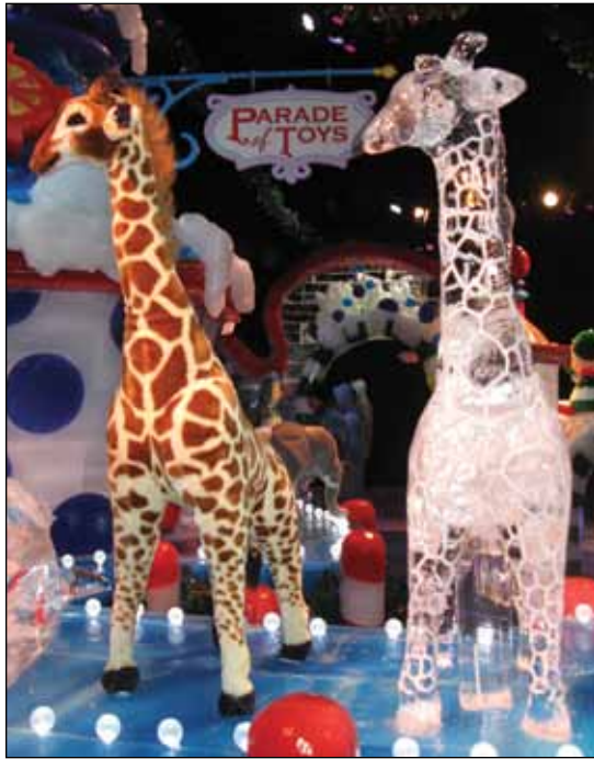
Left, a young child is dwarfed by a giant ice Santa and Christmas tree. Above, an ice giraffe modeled on a stuffed giraffe.