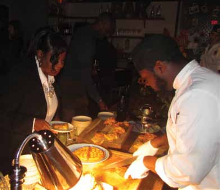
The "Mayor's Table" at Hen Quarter, above left, featuring photos of current Mayor Allison Silberberg and former Mayors Bill Euille and Kerry Donley. Above, guests enjoyed chicken and waffles.

A ribbon-cutting ceremony was held Wednesday night for the newly-opened Hen Quarter restaurant located at 801 King St. in Old Town Alexandria. The menu features southern classics such as deviled hen eggs, fried chicken and waffles, home-style biscuits, macaroni and cheese as well as craft cocktails.