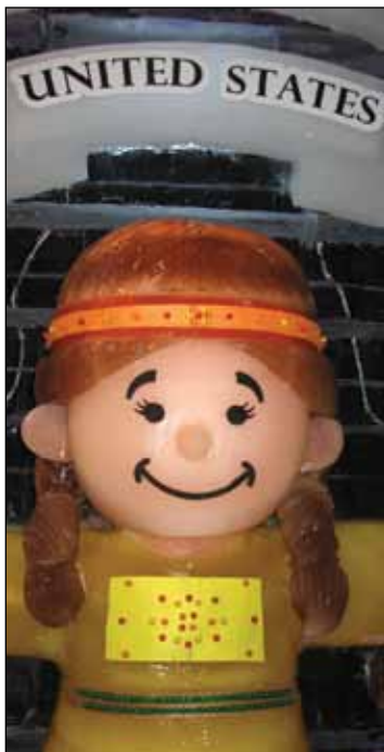
The United States was represented by a Native American child.

Kids enjoyed sliding down the long ice slide.